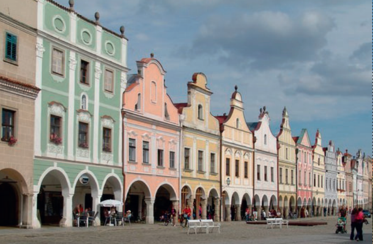
↑ The unique Baroque and Renaissance gables on houses surrounding the town square date to the 16 th century.