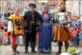
← Telč is a regular venue for a variety of summer and winter festivals as well as concerts and theatrical performances.