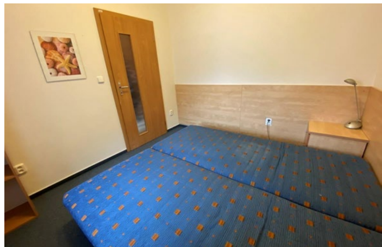
Bedroom with double bed