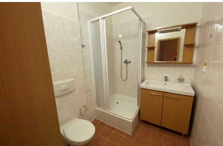
Bathroom with shower, sink and toilet