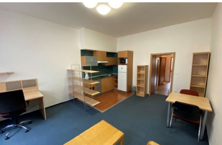
Combined living room and dining room with kitchenette