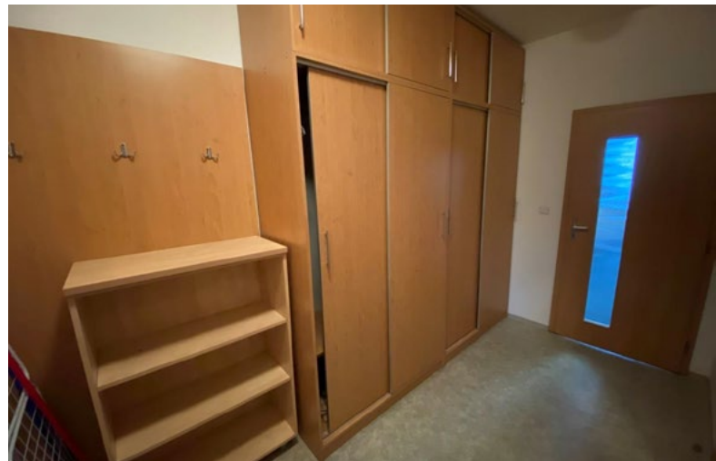
The hall with wardrobes and entrance door