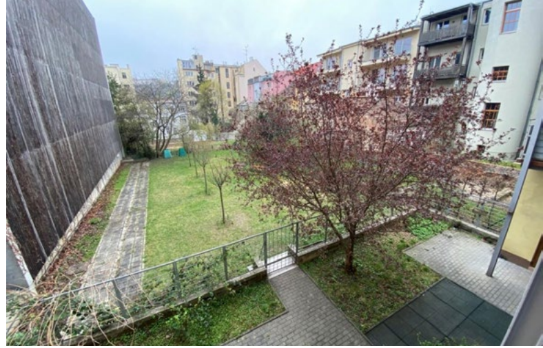
The private courtyard with garden adjacent to the building