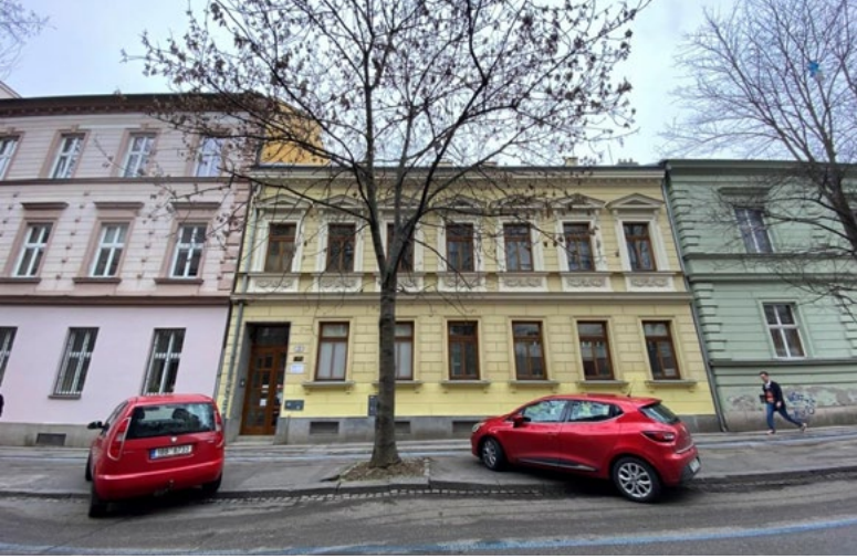
Building (the yellow one) from the outside, from Grohova Street