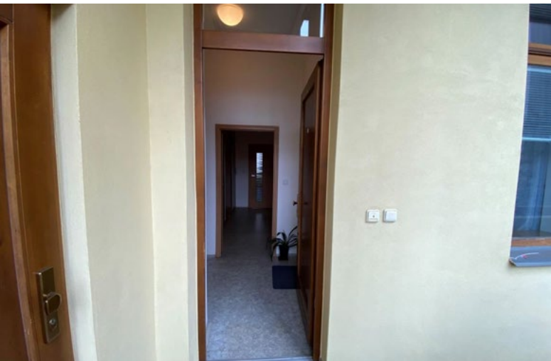
Entrance with the hall as seen from outside the flat